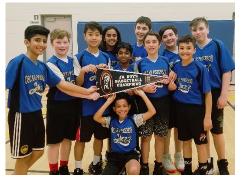
Jr. Boys Basketball Tournament Champs!